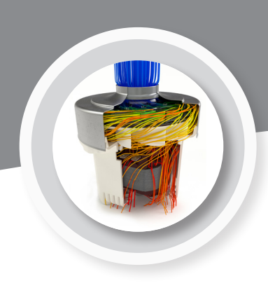
Research & Development